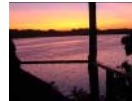
Sunrise from Little Egret Bungalow