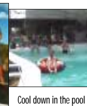
Cool down in the pool