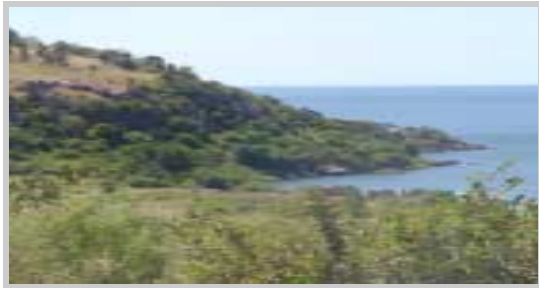
Wag Hill Lodge

The Lodge has two speedboats which are fully equipped with modern safety equipment, life jackets, sun canopy, GPS, fishing rods and tackle.