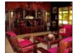
Cliff Chat Lounge