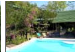
Pool & Entertaining Area