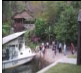
Arrival at Wag Hill Lodge Malachite Bungalow in background

Fishing for these species is part of the Wag Hill experience.