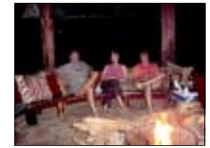
Relaxing by the fire at Fish Eagles View