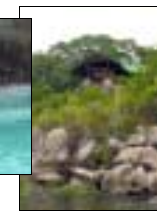
Little Egret Bungalow