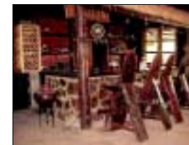
Cliff Chat Bar